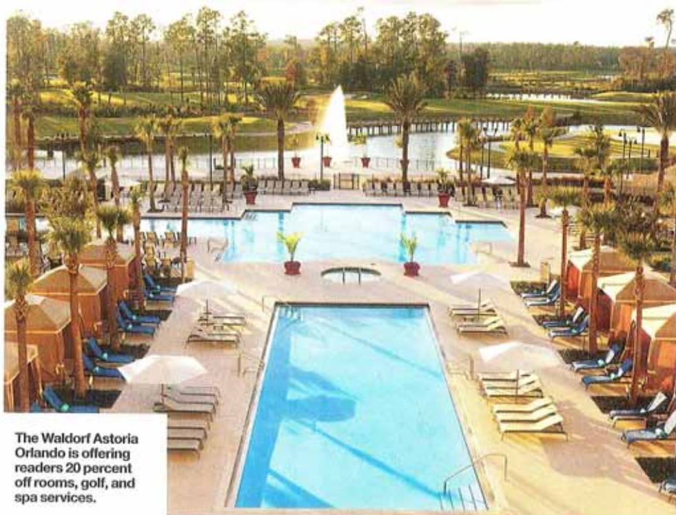
The Waldorf Astoria Orlando is offering readers 20 percent off rooms, golf, and spa services.

A $31-million facelift has rejuvenated the Miami Marriott Biscayne Bay, located at the